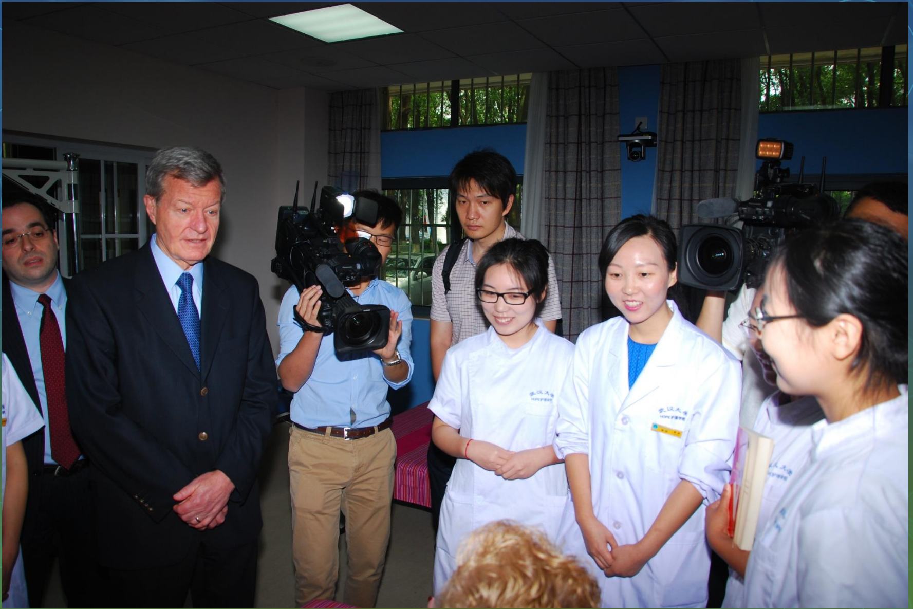
U.S. Ambassador to China